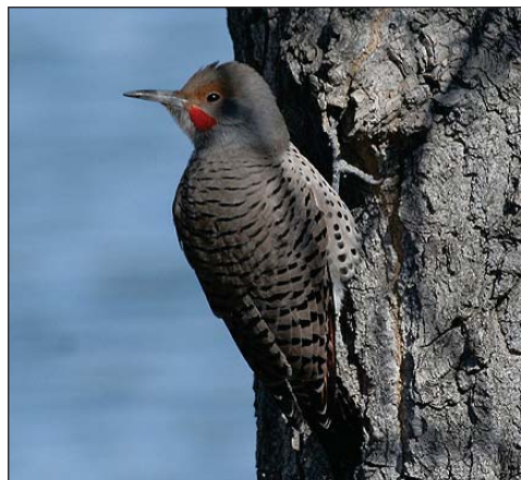
Red-shafted Flickers display flashes of bright colors under their wings when in flight, a beautiful contrast to the white winter landscape.

Water is also important for birds. When natural water sources are frozen, birds resort to eating snow. It takes energy to convert ice to water, lowering body temperature and even causing dehydration. Providing water often attracts birds that don't normally visit feeders. Birdbath heaters prevent water from freezing.