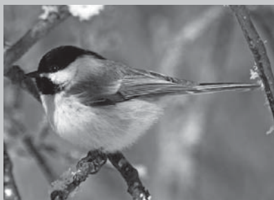
On the cover: Black-Capped Chickadee

Together, we are improving native bird populations, the land and the lives of people.