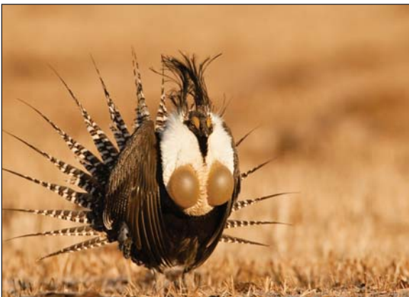
A male Greater Sage-Grouse struts his stuff.