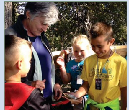
4th grade students helping release a Green-tailed Towhee at the Barr Lake Banding Station.

Many thanks go out to our donors and financial supporters who make this program possible: Adams County Open Space, Science Cultural and Facilities District, Science and Cultural Collaborative and the Urban Bird Treaty. Thanks also to our dedicated volunteers and Barr Lake State Park for helping us offer such a terrific learning experience.