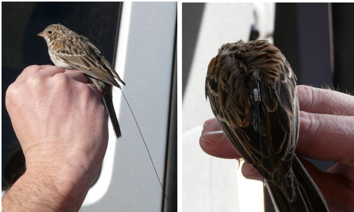
Figure 3. A Vesper Sparrow outfitted with a radio transmitter.

In order to avoid influencing the movements and locations of birds, we tracked each bird from a distance using two observers. After detecting a bird, each observer recorded their own location, the bearing to the bird, and estimated its distance from the observer. We then closed in on the bird to determine its exact location, flushed it, and then estimated percent cover of bare ground, grass, and shrubs, as well as mean shrub and grass height, within a 5 m radius around the location of each bird. If the bird's exact location could not be determined in the field we would triangulate it in GIS using the initial observer locations and recorded bearings.