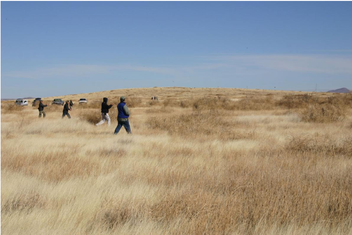
Figure 2. Biologists corral grassland birds towards mist-nets during flush-netting.

We selected four study sites on El Uno that were comprised mainly of grasslands with scattered mesquite ( Prosopis sp.) and separated from each other by roughly 1-5 km. At each site we set up a line of 4-6 mist-nets in a slight semi-circle in front of some shrubs (to provide a dark background for the nets), and then using all available people, we corralled birds from roughly 100-200 m out from the nets and flushed them toward the nets as we closed in on them (Figure 2). Although we attempted this practice at all times of day, we generally had higher success in the morning and evening, when winds were calm and the sun was low in the sky.